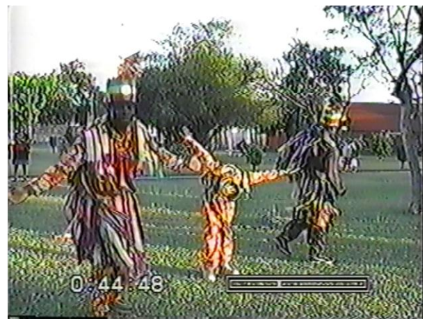
Fig.13 – The end