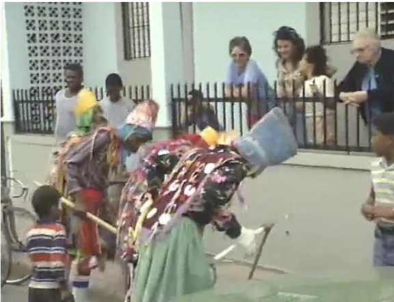
Fig.18 – Initial bow to the audience

triangle and fife (Fig.17). The drums are made of wood and animal skin. The music is slow and march like at this point. At a signal from the fife the rhythm section is called to a halt whilst the performers in their line-out formation are bowing to the audience (Fig.18). Primo then starts with his version of the opening lines of the play text (Fig.19):