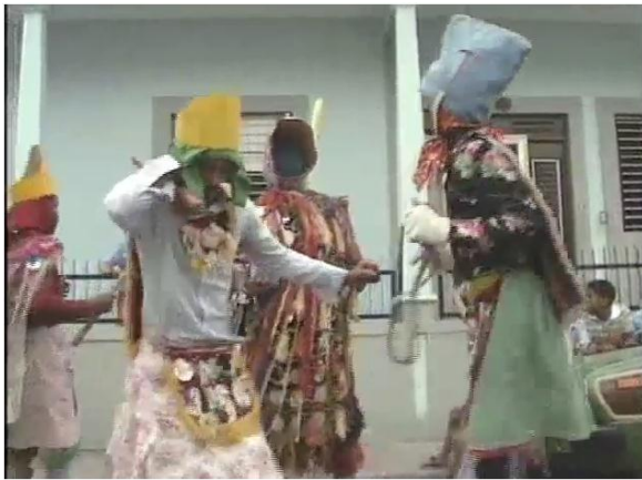
Fig.22 – Dancing resumes

After the lines spoken by Primo, the dancing resumes (Fig.22) and it is probable that the rest of the play including the action previously described (Figs.14, 20, 21 and 23 below) would have unfolded in between these musical interludes (in accordance with the Roberts recording).