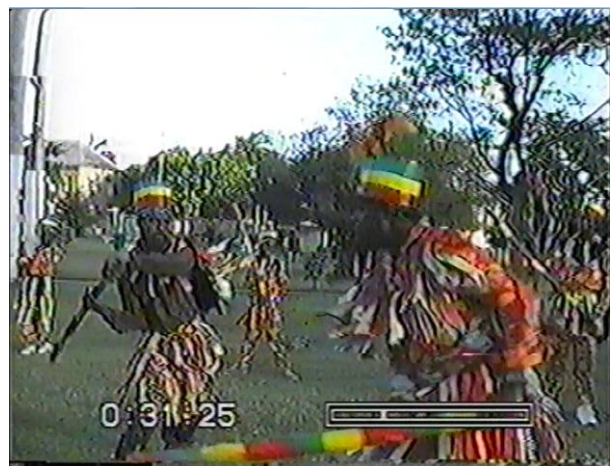
Fig.9 - St.George and Slasher clash staves

The end of the dancing is signalled with a blast on a football referee's whistle. The musicians stop playing, and the actors pick up their staves and form a semicircle. The first actor (named St.George later in the play, but here with the lines of St.David quoted above) goes round all the other actors in no particular order and gives their staves a mighty thwack with his own. He then declaims his