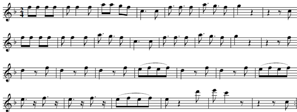
Fig.5 – Sample of phrases played by the Mummies' fife player. This is only a rough transcription, as befits the extemporary nature of the music.

The actor dancers enter in procession along a path, taking a turn towards the camera before moving onto the grass to perform. The procession is headed by three musicians walking abreast as they play. They are dressed in everyday clothes and they play a fife, a snare drum and a bass drum. The bass drum strikes a steady beat, while the snare drummer maintains a continuous syncopated drum roll. The fife music consists of repetitive phrases drawn from a core of several different melodies, although these are freely varied with grace notes and other extemporisations (e.g. Fig.5).