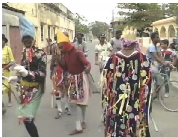
Fig.15 – Initial procession