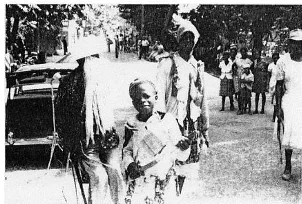
Fig.4 - Queen of Shava, St.Kitts

The scripts collected by Abrahams are quite close to the original Ewing text. They are slightly shorter, having suffered the usual attrition of oral transmission, but the sequence of lines is largely intact, apart from a couple of repetitions. Variations in the words also arise from oral transmission. A few variations are quite radical, and in some cases no longer make sense. It is our observation that the lines that involve unfamiliar concepts and/or use particularly archaic or convoluted language have suffered most, as in the following example spoken by Saint David: