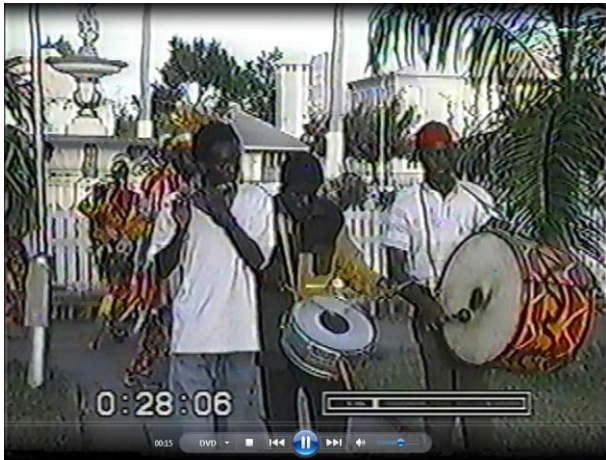
Fig.6 – Entering the square

three horizontal stripes of red, yellow and green, and with pointed crenulations. Two actors have feather cockades on the front of their crowns. One has long braids hanging down either side in front. They each carry staves about four feet long that are painted with broad bands of red, green and yellow, possibly meant to signify the national colours.