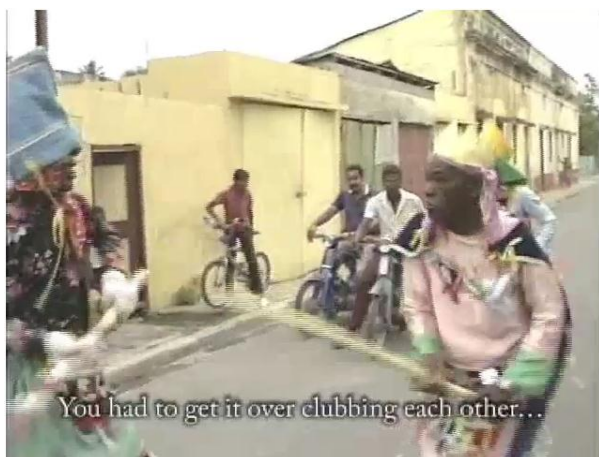
You had to get it over clubbing each other...