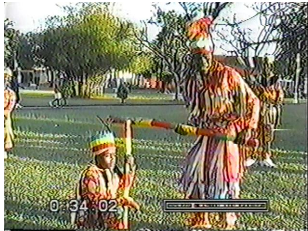
Fig.11 – The fallen Black Prince of Paradise

This time there is no introductory round of stick clashing before the speeches commence. St.George announces the death of the Black Prince of Paradise, signals for one of the boys to kneel in the middle of the circle, which he does with his staff placed vertically on the ground (Fig.11), and then calls for him to be taken away. The delivery continues with his habitual stick clashing with other cast members after every line or two. The King of Egypt (the actor who was Slasher earlier) enters, seeking his son. St. George gives him the bad news. Their dialogue becomes a dispute (Fig.12), during which the Black Prince of Paradise rises back into line, and at the point where a combat would ensue, the whistle blows again for another round of dancing. In this case the dance incorporates two short stick clashing duels. A whistle ends the dancing.