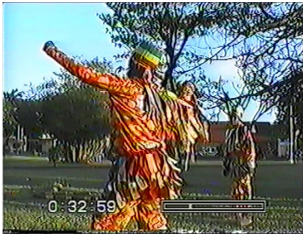
Fig.10 – Second dance - Gyrating

Although this is a classic challenge dialogue, there is no fight, except for the ubiquitous clashing of staves mentioned above (Fig.9). The end of what we may call Act One is signalled by a short toot on the fife. The music starts up. The actors drop their staves to the ground, and another series of dances by pairs of actors takes place (Fig.10). This likewise is terminated with a blast of a referee’s whistle, and the actors retrieve their staves.