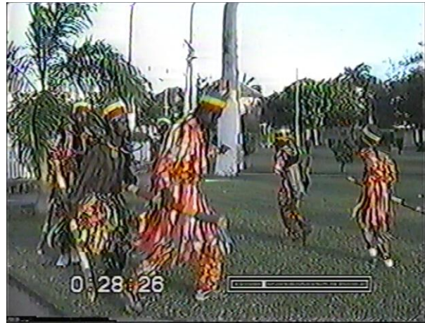
Fig.7 –Circling dance

On leaving the path, the musicians move to one side and back up towards a nearby tree. The dancers, meanwhile, initially dance in a circle, breaking into a sort of trot (Fig.7). They soon move into a line facing the camera and drop their staves to the ground while continuing to dance. The audience is not very apparent; just a few people under the aforementioned tree, although there may have been an audience behind the camera. There immediately follows a series of figures in which pairs of dancers spiral towards each other while dancing a particular move. These moves include, gyrating the hips suggestively, hopping on one leg with the other leg extended forward (Fig.8), a sort of backwards run, hopping alternately with the legs to the side to achieve a swaying effect, hopping on one leg while turning the other foot through 180 degrees as in The Twist , and so on.