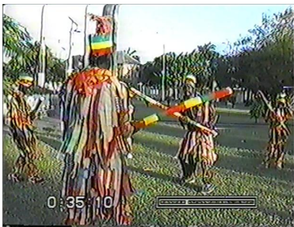
Fig.12 – King of Egypt disputes with St.George

This time there is no introductory round of stick clashing before the speeches commence. St.George announces the death of the Black Prince of Paradise, signals for one of the boys to kneel in the middle of the circle, which he does with his staff placed vertically on the ground (Fig.11), and then calls for him to be taken away. The delivery continues with his habitual stick clashing with other cast members after every line or two. The King of Egypt (the actor who was Slasher earlier) enters, seeking his son. St. George gives him the bad news. Their dialogue becomes a dispute (Fig.12), during which the Black Prince of Paradise rises back into line, and at the point where a combat would ensue, the whistle blows again for another round of dancing. In this case the dance incorporates two short stick clashing duels. A whistle ends the dancing.