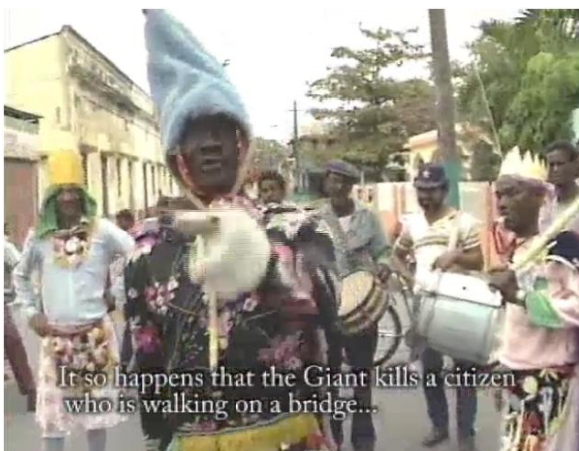
It so happens that the Giant kills a citizen who is walking on a bridge...