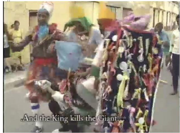
Fig.23 – The Giant killed

The costumes are richly decorated with mirrors and beads. It was remembered with pride by older members of the Cocolo community that they were able to create more impressive costumes with their greater resources in the Dominican Republic than was possible in their islands of origin.