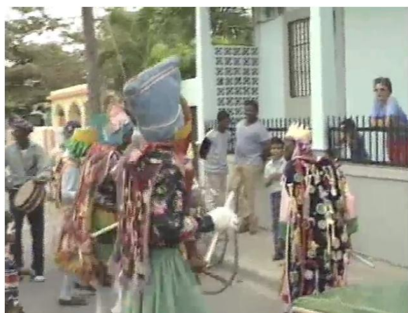
Fig.16 – Lining up in front of a house

“Mummies is a game that has a cast of a Giant, a Doctor and a King. It so happens that the Giant kills a citizen who is walking on a bridge... And the King finds the dead citizen... And he wants the Giant, as an order to bring to life the dead... In the middle of this, a Doctor, in a horse, appears... And the Doctor gives a medication to the dead that is already dead... And bring him to life! And they fight clubbing each other... And the King kills the Giant... In between dances, they do different choreography... It is very beautiful!”