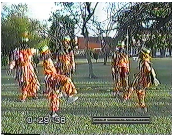
Fig.8 – Pair from the first dance

On leaving the path, the musicians move to one side and back up towards a nearby tree. The dancers, meanwhile, initially dance in a circle, breaking into a sort of trot (Fig.7). They soon move into a line facing the camera and drop their staves to the ground while continuing to dance. The audience is not very apparent; just a few people under the aforementioned tree, although there may have been an audience behind the camera. There immediately follows a series of figures in which pairs of dancers spiral towards each other while dancing a particular move. These moves include, gyrating the hips suggestively, hopping on one leg with the other leg extended forward (Fig.8), a sort of backwards run, hopping alternately with the legs to the side to achieve a swaying effect, hopping on one leg while turning the other foot through 180 degrees as in The Twist , and so on.