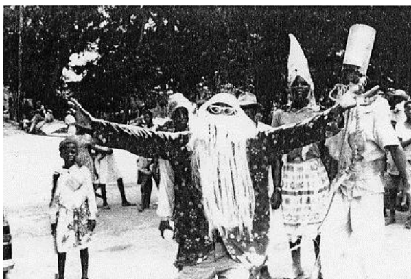
Fig.3 - Father Christmas, St.Kitts

Figs.3 & 4 show Abrahams' photographs of the St.Kitts' Mummies' Father Christmas and Queen of Shava respectively, with other characters and audience in the background (Abrahams, 1968). 16 The costumes are fairly simple and will bear comparison with the costumes filmed 40 years later by McMurray. Father Christmas wears a long false beard, which could be interpreted as dressing according to part. The other characters, however, wear fairly simple nonrepresentational costumes, covered in handkerchiefs or pieces of cloth, with prominent headgear of various shapes. A couple of these hats are quite tall.