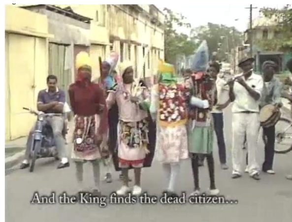
And the King finds the dead citizen...